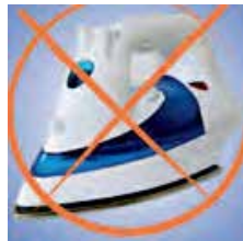
Better Wrinkle Resistance