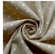
Extremely Durable and Wear Resistant