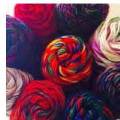
Huge Range of Shades