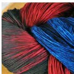
Everlasting Multi-Coloured Effect

Huge range of high quality yarns with everlasting multi-coloured effect, and environment protection and excellent moisture management property. Available in more than 60 standard colours. Different effects and looks can be created by playing with blend and variation in dyeing.